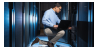
Turnkey HPC and Cloud