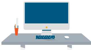
Units Return to Pool