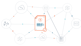
Shared Unit Pool

With Altair Units – our patented, unified licensing system – you get the ability to overcome any challenge through access to Altair’s industry-leading technology. Units offer teams and organizations unmatched power and flexibility by letting users run software and workloads from anywhere, giving them the freedom to choose what technology they need when they need it, and delivering unparalleled value for more than 150 Altair and partner products.